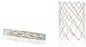
CP Stents (Unexpanded and Expanded)

The Bare CP Stent® is balloon expandable and intended to permanently stay in your body. The CP Stent® is composed of heat treated metal (90% platinum and 10% iridium) wire that is arranged in laser welded rows with a “zig” pattern. The number of rows will determine the unexpanded length of the stent.